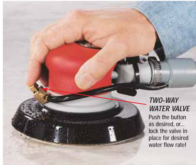
TWO-WAY WATER VALVE Push the button as desired, or... lock the valve in place for desired water flow rate!